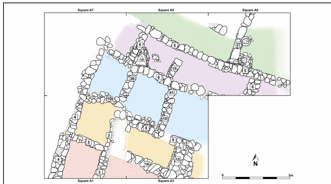
Khirbat Safra Field A.